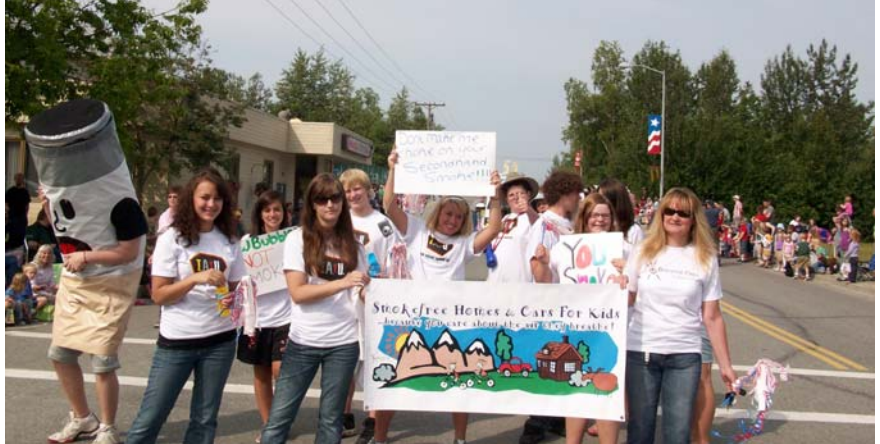
Some of the Mat-Su Clean Air members in a parade

Gearing up to launch a Smoke-Free Palmer Campaign