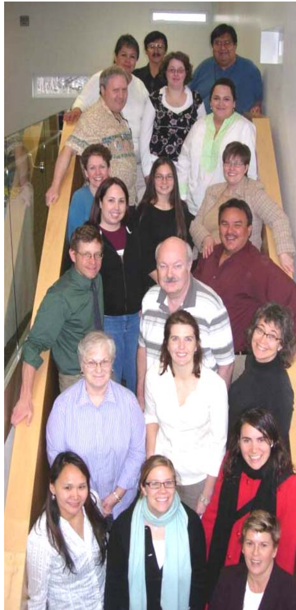
This photo is from the November 2007 Steering Committee Meeting.