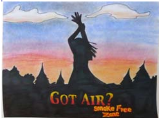
Two of the 100+ entries to the poster contest from students in the Bethel area.