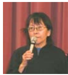
Former Bethel Mayor Agnes Phillips